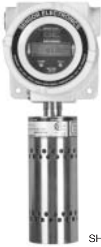
SHOWN WITH SEC MILLENIUM SENSOR